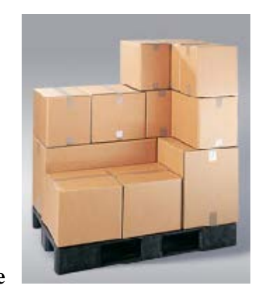
Stackable vs. Non Stackable